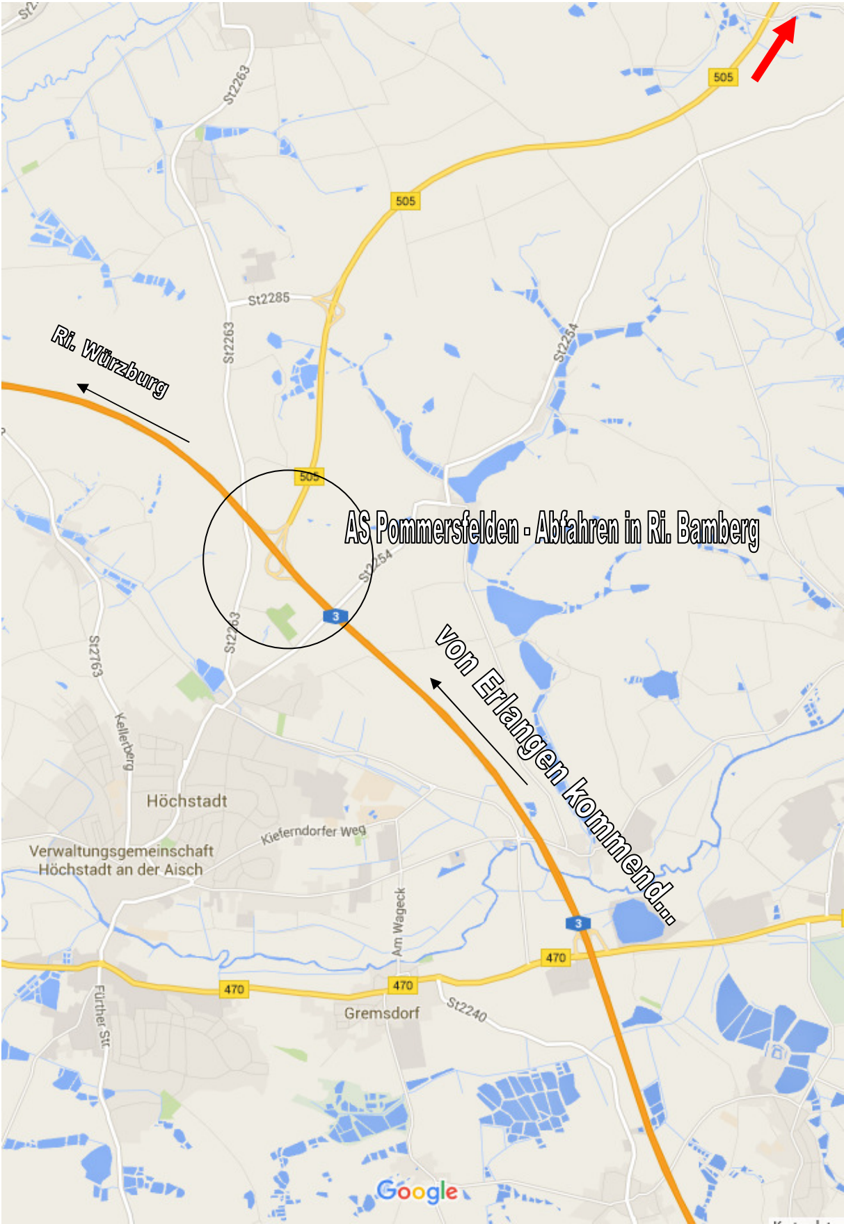
Anfahrtskizze, B 505 - 08.07.2016